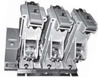
3 Pole, 700A, 600V