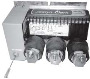
3 Pole, 320A, 1500V